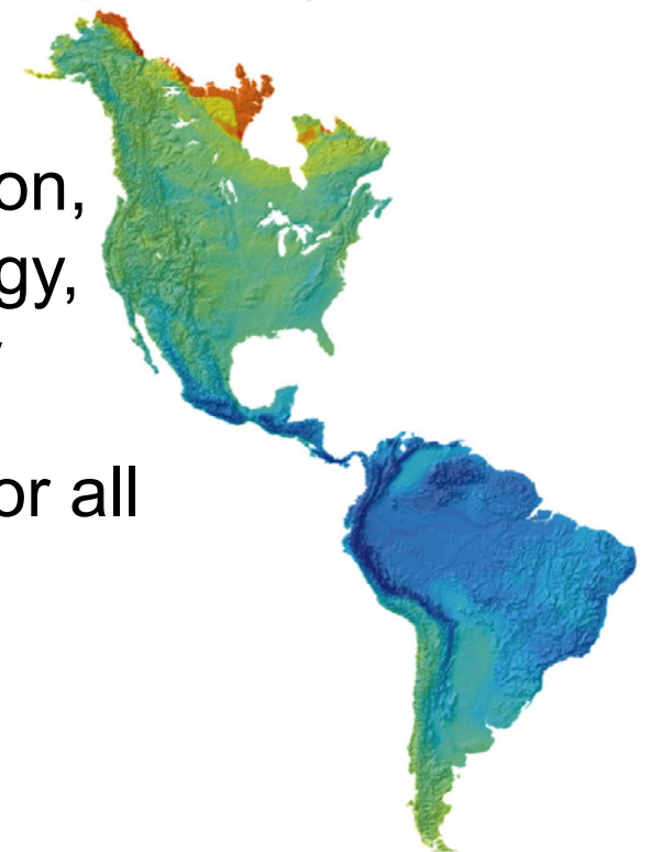
(B) Body size of breeding birds