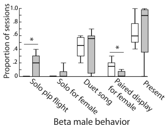
Figure 3: Behavioral changes by beta males in the 10 days following experimental removal of their alpha partners. Bars indicate the proportion of observation sessions in which betas performed behaviors before ( white ) and after ( shaded ) the removal of their alpha partner ( n = 8 beta males). Horizontal lines indicate median values, boxes surround the 25%–75% intervals of the data, and vertical lines show data within 1.5 interquartile ranges of this interval. Betas performed only solo pip flight (attraction) displays after their partners were removed (linear mixed effects [LME]: t = -3.12 , df = 7 , P = .02 ). Several betas also performed solo displays for females on the dance perch, but this increase in display rate was not significant (LME: t = 1.48 , df = 7 , P = .18 ). In general, betas continued to perform duet songs and were present for the majority of observation sessions following the removal of their alpha partner (LME: t = 0.14 for duets and -0.67 for presence, df = 7 , P > .5 for both). While some males also formed new partnerships and performed two-male displays for females on the dance perch ( n = 3 former betas), the overall rate of paired displays decreased when compared with display rate when the removed alpha was present (LME: t = 2.72 , df = 7 , P = .03 ).

tem, this would be the case if the alpha's current reproductive success increases his beta partner's later reproductive success. Female fidelity to display sites provides one mechanism by which this might occur; in long-tailed manakins, females return to the same display sites to copulate, even when the attending alpha male is replaced (McDonald and Potts 1994). However, such a mechanism would predict high site fidelity by beta males as well, which was not the case in this study. Pseudoreciprocity could also result if betas benefit from interactions with alphas by learning skills involved in successful courtship displays. By helping alphas attract females, betas witness and participate in more successful courtship displays, which may improve their own display competence when they later become alphas. More comprehensive analyses of male reproductive success and female mate choice in multiple years offer one means of testing these possibilities.